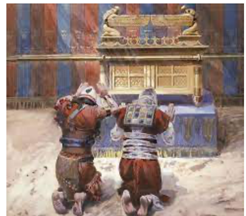
Moses and Joshua in the Tabernacle (c1899) by James Tissot (1836-1902) Gouache on board, Jewish Museum, New York

Early the next morning Joshua had Israel come forward by tribes, and Judah was chosen. The clans of Judah came forward, and the Zerahites were chosen. He had the clan of the Zerahites come forward by families, and Zimri was chosen. Joshua had his family come forward man by man, and Achan son of Karmi, the son of Zimri, the son of Zerah, of the tribe of Judah, was chosen. (cont.)