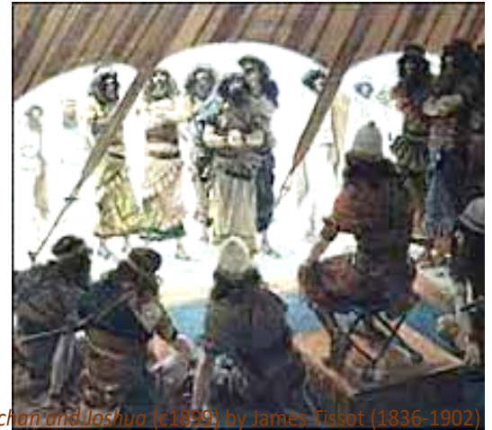
Achan and Joshua (c1899) by James Tissot (1836-1902)

So Joshua sent messengers, and they ran to the tent, and there it was, hidden in his tent, with the silver underneath. They took the things from the tent, brought them to Joshua and all the Israelites and spread them out before the Lord.