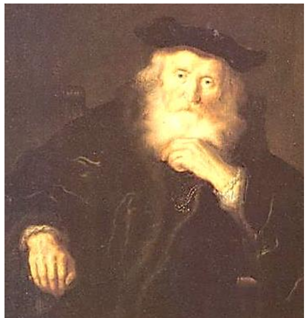
Detail, Old Man Wearing a Beret (1648), [also called Old Man Thinking ] by Salomon Koninck (1609 - 1656) Oil on panel, Private collection