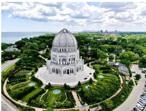
House of Worship, Wilmette, Illinois

Besides the Lord making all things new all the time, what in the world’s going on?