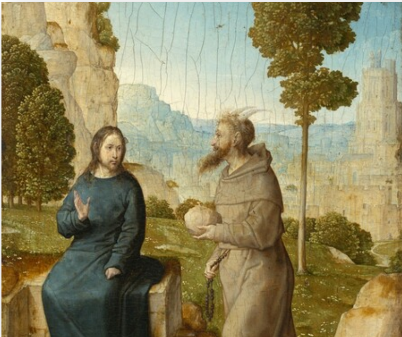
The Temptation of Christ (c.1502) by Juan de Flandes (1460-1519) Oil on panel National Gallery of Art, Washington D.C.

8 Again, the devil took him to a very high mountain and showed him all the kingdoms of the world and their splendor; 9 and he said to him, 'All these I will give you, if you will fall down and worship me.' 10 Jesus said to him, 'Away with you, Satan! for it is written, "Worship the Lord your God, and serve only him."' "