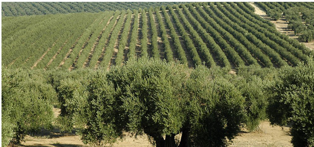
Olive trees and vineyard

These words of Jotham signify that the citizens of Shechem were not willing to have celestial good, which is the "olive tree," nor the truth of that good, which is the "vine," nor moral good, that is, external celestial and spiritual good, which is the "fig tree," to reign over them, but the evil of falsity, which appeared to them as good, which is the "thorn bush;" the fire from this is the evil of lust; the "cedars of Lebanon" are things rational which are from truths. In most places the olive tree and the vineyard are mentioned together, which is done because of the marriage of good and truth in every particular of the Word; for "olive tree " and "oil" signify the good of the church, and "vineyard" and "wine" the truth of that good.